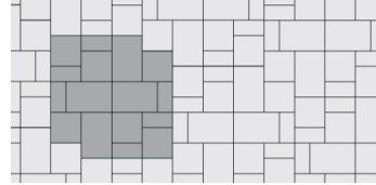
LP METRO FIXED RANDOM G