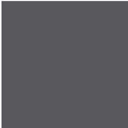
EDGE ZERO EDGE DETAIL