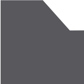
EDGE CHAMFERED EDGE DETAIL